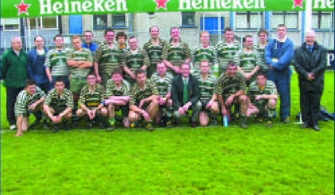
Senior Squad prior to the play off game